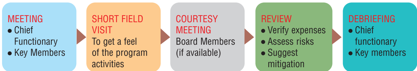
Figure 1: What happens during a FRAMS+ Visit